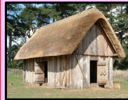
Beowulf and Grendel