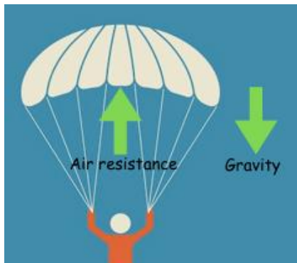
Air resistance slows down the parachute as gravity pulls it to the ground.