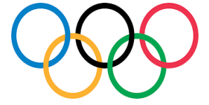
The Olympic Games logo