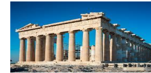
The Parthenon, Athens

Myths like Pandora's Box; Jason and the Argonauts; and Theseus and the Minotaur teach us about their religious beliefs and culture.