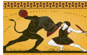
Theseus and the Minotaur

Ancient Greece was not one country but many City-States. Two of the most important were Athens and Sparta. Athens was famed as the birthplace of democracy. Whereas, Sparta was ruled by a King. Athens only educated boys and favoured subjects such as mathematics, poetry and philosophy. Sparta educated both boys and girls but the only subject was warfare.